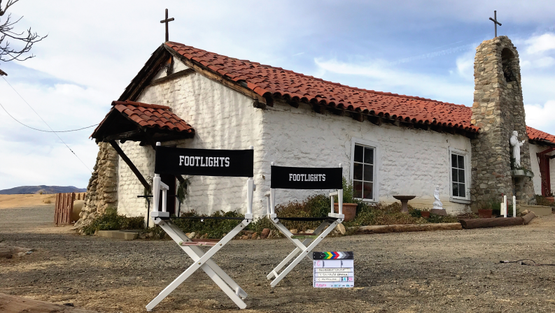
One of the sets of "Probable Cause: Ultima Cena" (2017)

on. It has evolved into this amazing community of creators who believe in it whole heartedly and we couldn't be more humbled by the support they give, and the support we get from friends, family and fans.