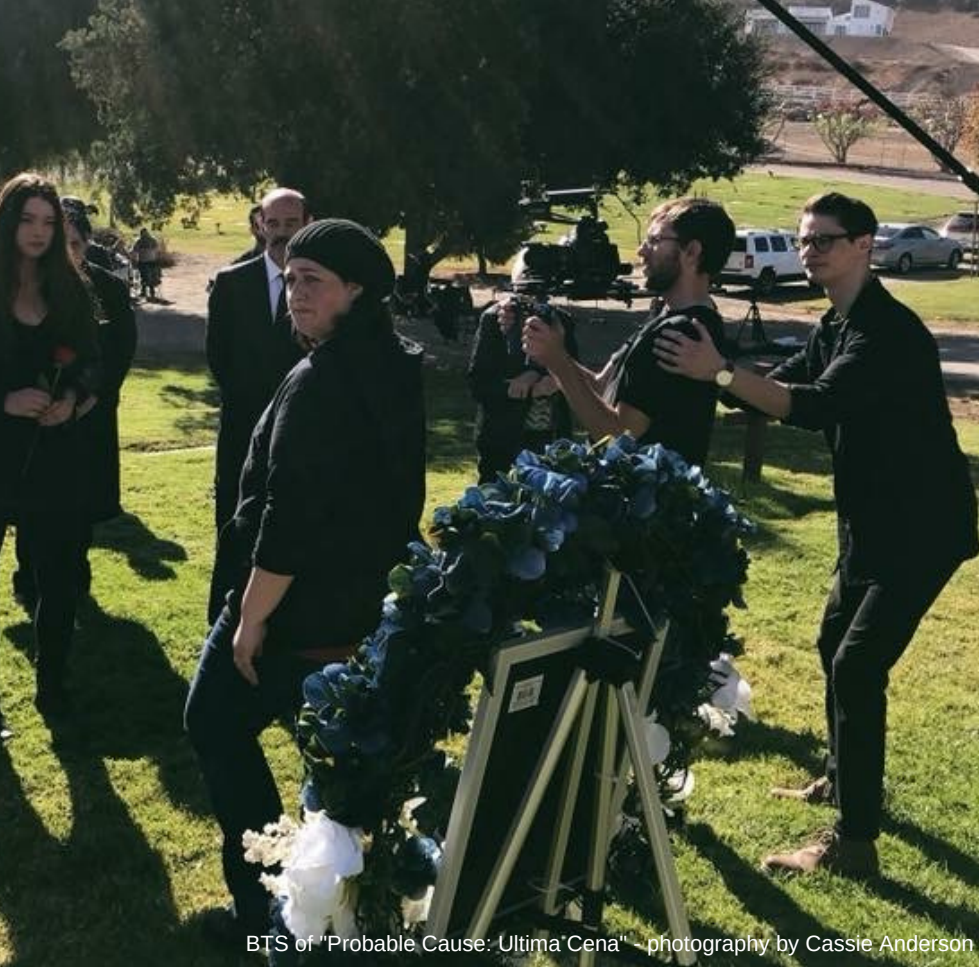
BTS of "Probable Cause: Ultima Cena"