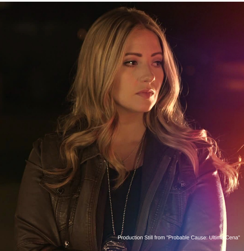
Production Still from "Probable Cause: Ultima Cena"

The ultimate goal is to fully sustain myself and my family by doing what I love. By having a strong community of inclusive filmmakers/TV-makers. Right now, with the Footlights, we're dedicated to enhancing equal opportunities in the industry, however it's on a small scale. But it starts somewhere and is already growing. I'd love to see it grow into something where we no longer have to worry about fighting for equal opportunities and it just is - all the while continuing to make something great with passion at the forefront. And, at the end of the day, I just want to be a part of that. - ia